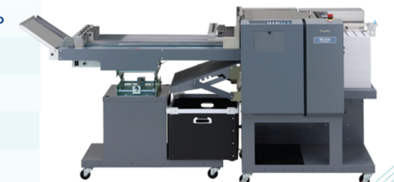
DC-516 Pro comes with one cutting module, one slitting module and one creasing module