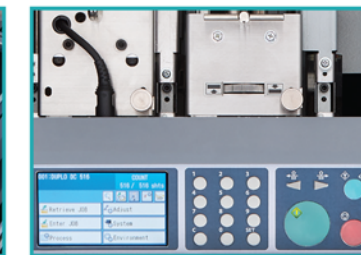
A color and user-friendly control panel stores up to 250 jobs for quick changeover