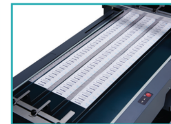
Long Conveyor handles stacking of high volume jobs