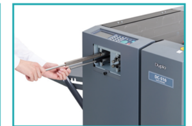
New creasing module includes a dual creasing tool with the capability to perform positive or negative patterns