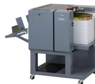
DC-516 comes with two creasing modules